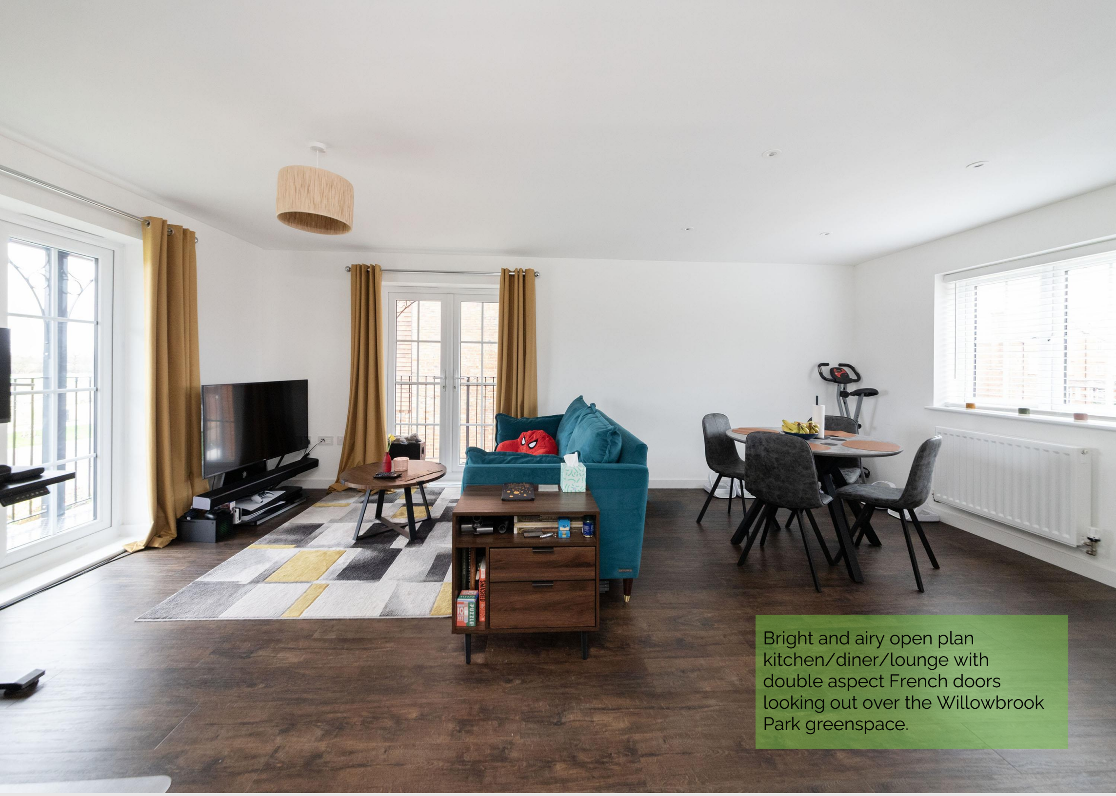
Bright and airy open plan kitchen/diner/lounge with double aspect French doors looking out over the Willowbrook Park greenspace.